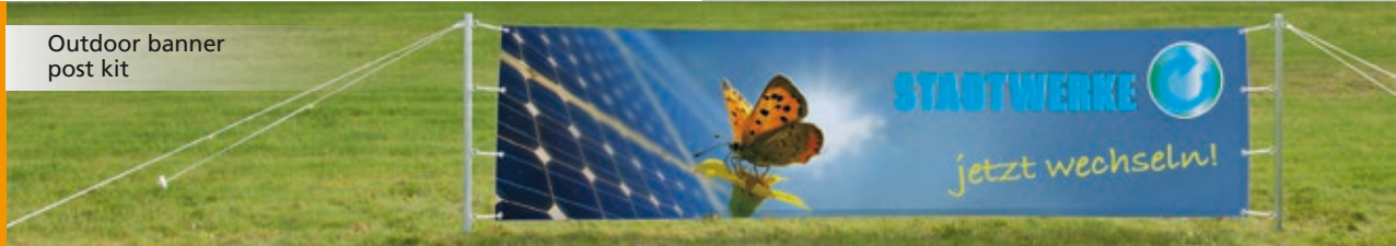
Outdoor banner post kit

As we are constantly developing our products we reserve the right of changing technical issues and dimensional deviations.